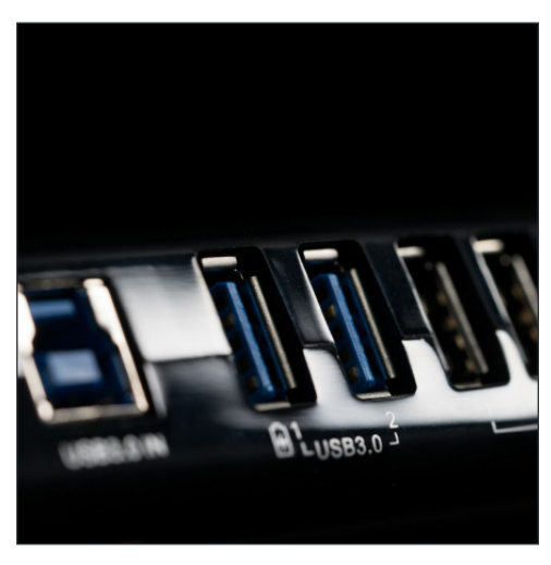
Simple BYOD Connectivity Central hub for connecting to a network, dual displays, camera, audio endpoints, network, and other peripherals.