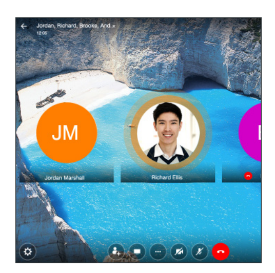
Enhances Any Cloud-based App Add pro-quality audio and HD video to your app, such as Microsoft Teams, Zoom, WebEx, and GoToMeeting.