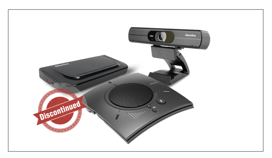
Bring plug-and-play connectivity with quality audio and 4K video to enhance the BYOD meeting room experience.