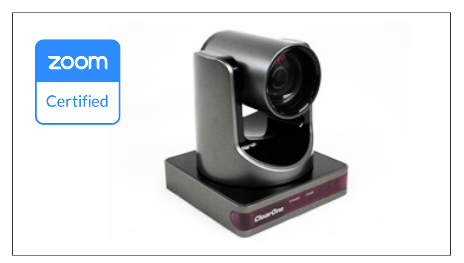
Professional-grade HD USB PTZ camera for conference rooms, webconferencing, UC applications and more.