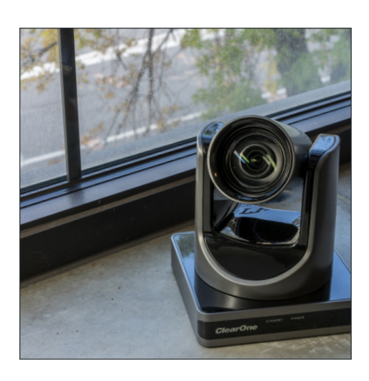
Plug-and-play Simple USB 3.0/2.0 compatibility with UVC and UAC protocol support.

Transforms any meeting room into a professional-grade video collaboration room.