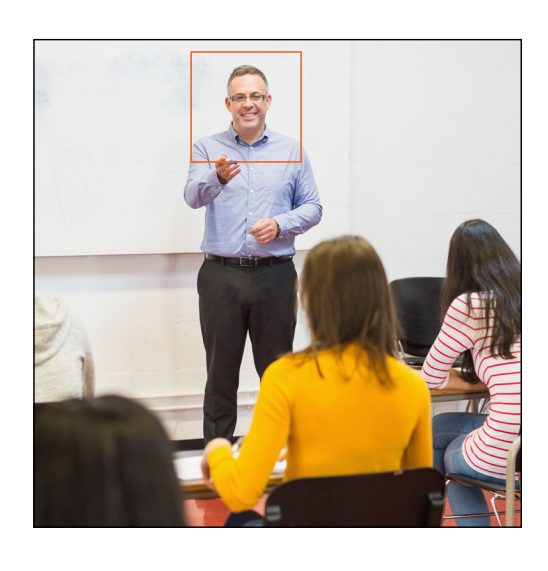
Al-based Smart Face Tracking

Al-based smart face tracking keeps the selected presenter in the frame as they move around the room.