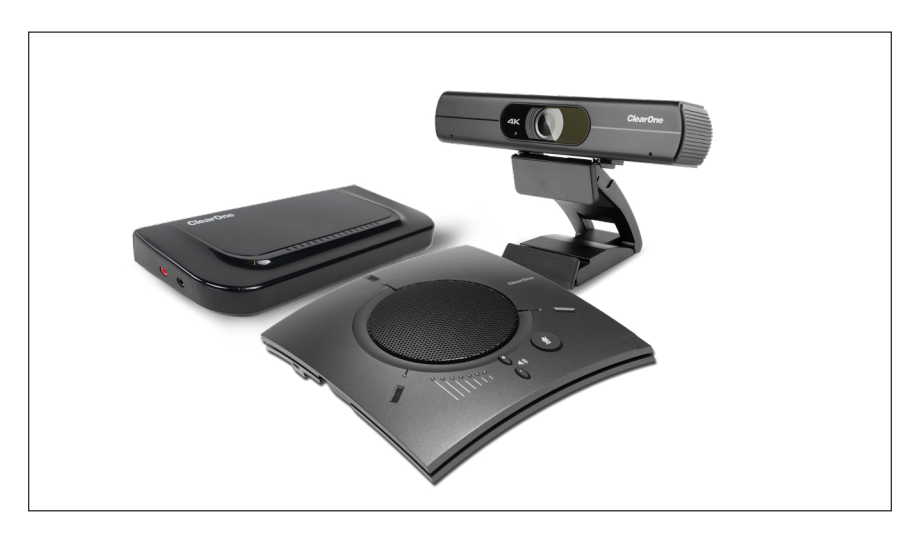
Bring plug-and-play connectivity with quality audio and 4K video to enhance the BYOD meeting room experience.