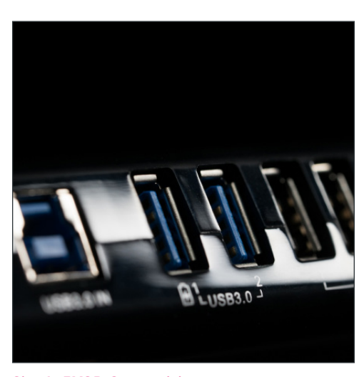
Simple BYOD Connectivity Central hub for connecting to a network, dual displays, camera, audio endpoints, network, and other peripherals.