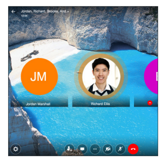
Enhances Any Cloud-based App Add pro-quality audio and HD video to your app, such as Microsoft Teams, Zoom, WebEx, and GoToMeeting.