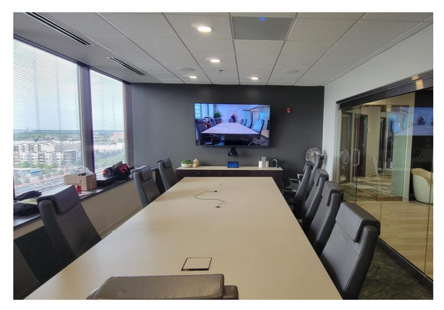
4 ceiling speakers along with ClearOne's CONVERGE Pro 2 48VT DSP in McGuire Sponsel main conference room optimize simplicity and functionality, making conferencing experiences more positive for all participants.

The main conference room system also includes four 6inch in-ceiling speakers to ensure every participant can hear clearly. In order to optimize the simplicity and functionality of meetings, Chrismin Communications wisely chose to specify the ClearOne CONVERGE Pro 2 48VT DSP, which enables integration with VoiP audio services so the ClearOne microphone audio can be routed to McGuire Sponsel's familiar VoiP service. The room includes a control system as well, and the integrator added a wireless tablet to provide fast access and control of all the room's equipment.