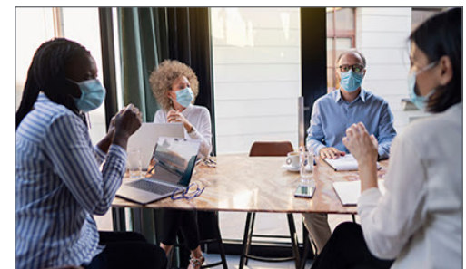
Provides room-filling sound for medium-sized meeting rooms.