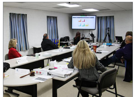
Pairs with BMA CT or BMA 360 for large meeting spaces.