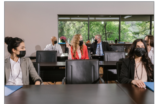
Delivers professional audio in classroom settings.