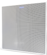
BMA CT ClearOne's patented Beamforming Mic Array Ceiling Tile

The BMA CT blends in perfectly with today's drop ceilings, with integrated features that significantly reduce system design complexity, simplify installation, consume less rack space, and lower project cost.