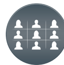
9-way Integrated MCU