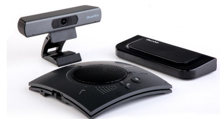
ClearOne Aura Versa 50 complete collaboration solution includes an ePTZ camera, CHAT 150 speakerphone, and Versa 6 port USB Hub