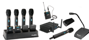
DIALOG® 20 2-Channel Wireless Mic System

Part of ClearOne's family of powerful Digital Signal Processors available in multiple versions with different combinations of audio inputs, audio outputs, network interfaces, peripherals, and software for configuration and control.