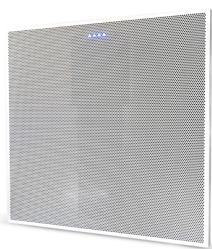
BMA CT ClearOne's patented Beamforming Mic Array Ceiling Tile

The BMA CT blends in perfectly with today's drop ceilings, with integrated features that significantly reduce system design complexity, simplify installation, consume less rack space, and lower project cost.