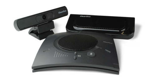
Aura™ Versa™ 50 is a plug-and-play system including a UNITE® 50 ePTZ camera, CHAT® 150 USB speakerphone, and Versa USB Hub. Brings ClearOne's HDConference® audio technology and HD video to your home office.

Grothe also noted how, because Alarm.com is a technology company, it's expected that it employs the latest technologies for internal operations, no matter whether work is being done from home, a corporate office or a hotel room halfway around the world.