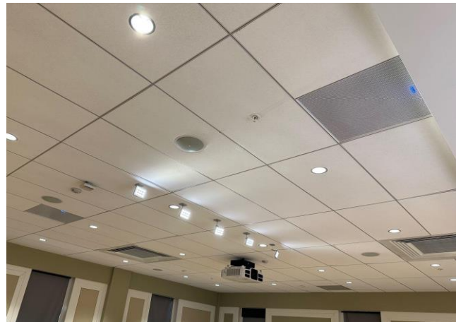
Beamforming microphone array solutions from ClearOne enable ultimate classroom flexibility for educators and presenters.

“Three years after we began this project, we would be hard pressed to find a student, parent or educator who expects anything less - it's essentially a requirement now,” Bannan explained. “In the competitive college landscape, staying ahead of technology trends is vital to achieve enrollment goals and provide all students equitable access regardless of individual situations or external disruptions. Additionally, using the same solutions across campus has raised the tech confidence of staff and offers a simple, intuitive setup that even guest speakers or event hosts can operate with ease.”